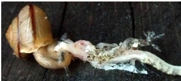
dead animals like this lizard... or what it finds, like popcorn.