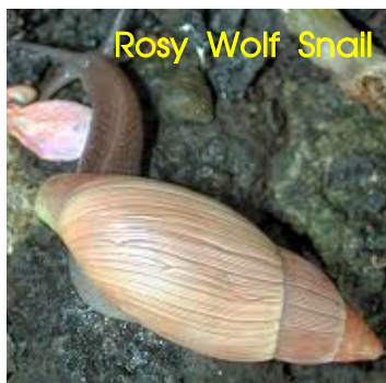
Rosy Wolf Snail

Do you see these snails in your yard? Both of them are not good for Hawai'i. They eat food crops, garden vegetables, native plants and endangered native snails. If you see one let an adult know. Do not pick up snails with your hands. You may get sick.