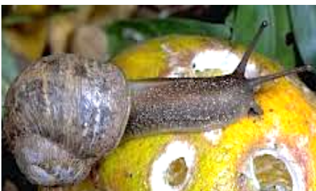
rotting fruits ...