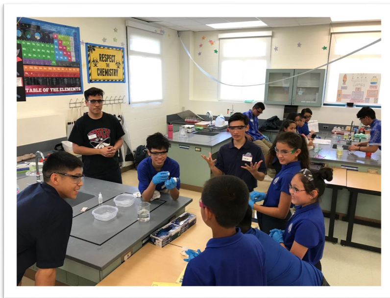
KS Maui High School Chemistry students sharing a Science demonstration with KS Maui 5th grade students in the Chemistry Lab.