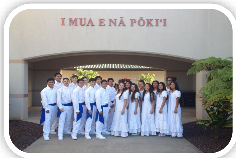
KS Maui Alumni from the Class of 2018 stand regal in their dress whites for Founder's Day 2018.

Participation in our December 19th Founder's Day celebration to honor the birthday of Ke Ali'i Bernice Pauahi Bishop, Founder of the Kamehameha Schools. Also, participation in the annual 'Aha Mele Song Festival where students share their gifts of mele.