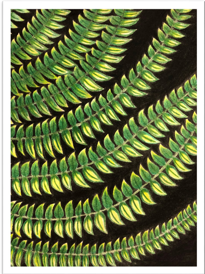
Artwork By: Kealia Sjostrand, KSM 2020

Note: AP Courses not mandated for Visual Arts Endorsement specialty areas.