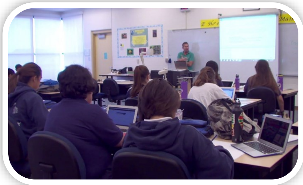
KS Maui Students listening on as their University of Hawai'i Maui College Psychology 100 Professor provides instruction.

Note: Academic Advising with designated Grade Level Counselors is highly recommended to determine course enrollment to meet both the Academy Endorsement and Enhancement requirements. These efforts help to ensure a successful completion of our students' Academic Plans.