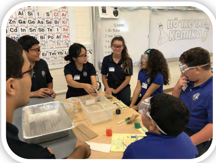
Hō'ike'ike Kemika – Chemistry Fair with the students of Papa Wauke and Kamehameha Papa 'Elua.