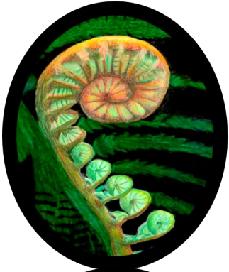
Connor Viela, KSM Class of 2021