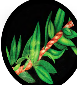
Hiwalani Nahoolewa, KSM Class of 2020