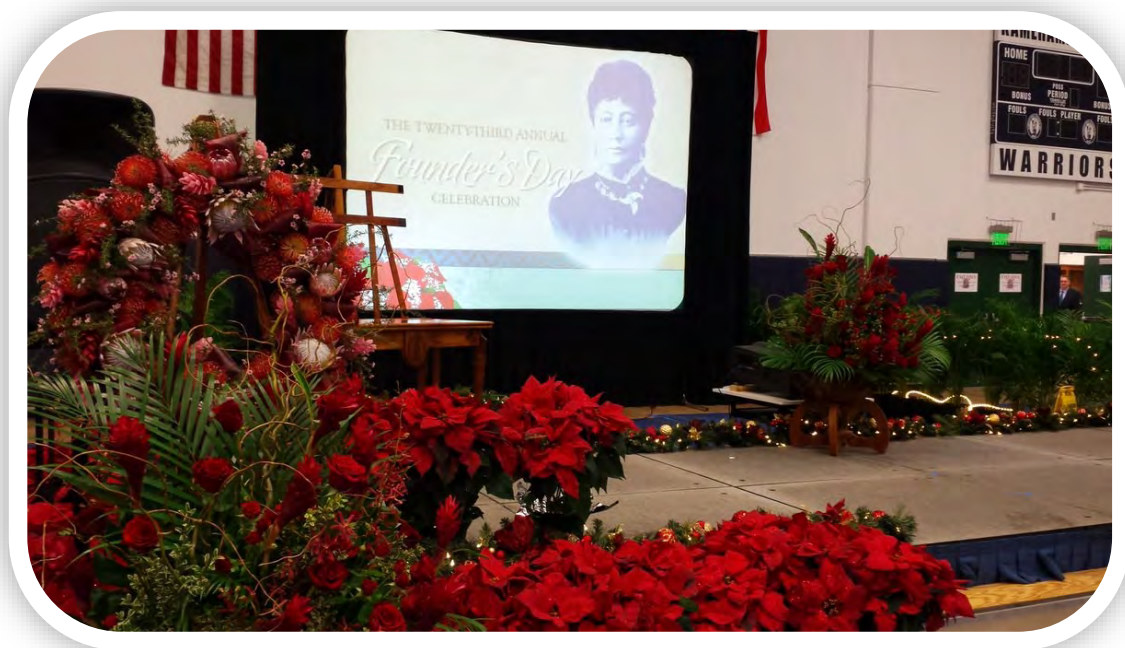
KS Maui stage set-up for Founder's Day held annually December 19th on campus.