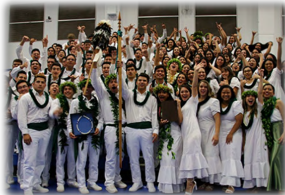
KS Maui Class of 2019 celebrate their win following the annual 'Aha Mele Song Festival.

A course that grounds haumāna in knowing traditional Hawaiian food systems, having the ability to learn about and address Hawai'i's present and future challenges around food sustainability and security, and the impacts to Hawai'i's natural, cultural and water resources. This course will also engage haumāna with the ahupua'a of 'A'apueo while incorporating 'āina and virtual 'āina-based educational lessons and engagements around diversified food production, understanding economic climate and feasibility studies, farm to school programs, food value chains, social well-being and overall health of Native Hawaiians as it relates to their nutritional diet.