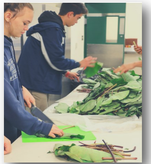
KS Maui haumāna work with and use the lau of the kalo plant to prepare a meal on campus