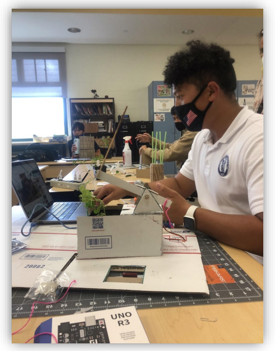
KS Maui students work on their Prototype Cyborg Mechanisms for Plant Clients in their Engineering & Design Development Course.