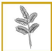
Stage 2 Empirical Pilot

During this stage program components are observed in action on a small scale. Program components are readily modifiable and there may be systematic variation of components to identify those that offer the most promise in the actual program context.