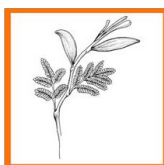
Stage 3 Field Test

The field test is a careful assessment of what the program can accomplish under realistic conditions. The program is closely aligned to recommendations from the Empirical Pilot but some adjustments may continue. A key characteristic of this stage is the limitation in scope and time.