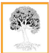
Stage 4 Mature

At this stage a program has successfully passed through the previous three stages. Historical results have demonstrated the effectiveness of the strategy. The program has a stable budget and organizational niche.